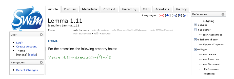
Fig. 5. A Flyspeck lemma in SWiM

is currently in progress. Pages and non-OMDoc links can be annotated with types from ontologies loaded into the wiki<sup>10</sup>.